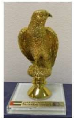
Emirates Philatelic Association Gold color falcon