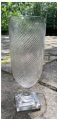
American Philatelic Society Glass vase