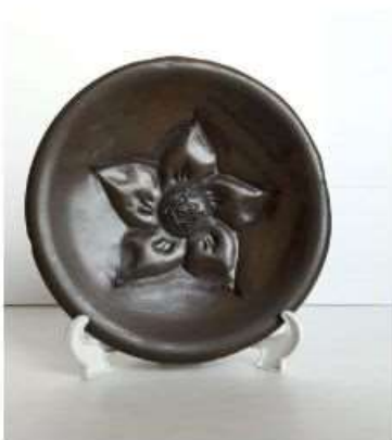
In memory of Yerimiyahu Rimon Bronze plate, Independence 1948