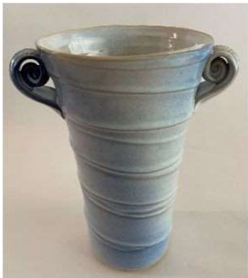
Handmade ceramic vase