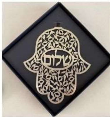
Israeli Philatelic Federation Hamsa with the word "peace"