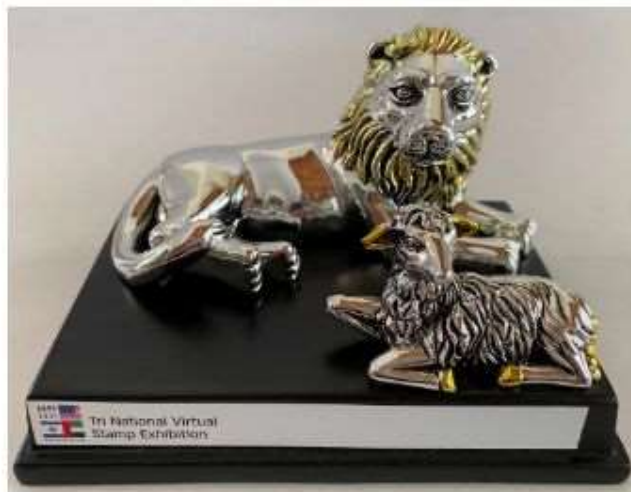
A lamb and a lion